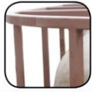
100% 6 Gauge Steel Frame