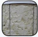
Energy Efficient Full Foam